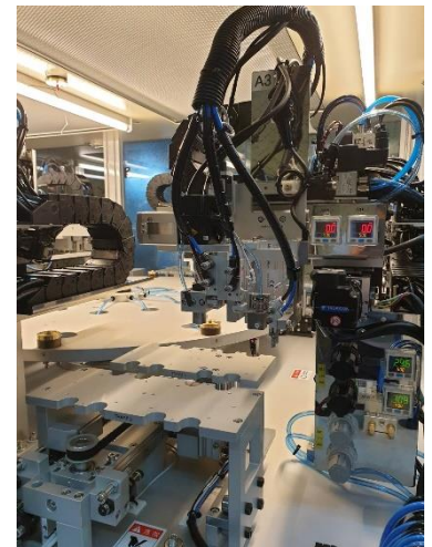
Inside Working Chamber